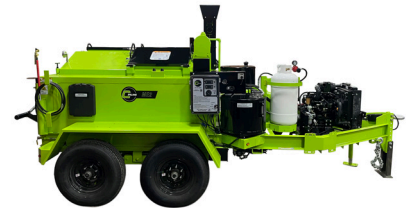
ME2 250 Gallon Mastic Melter Applicator