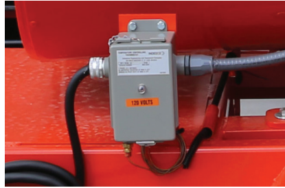
Overnight Heating System