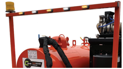
High Visibility LED Safety Lights