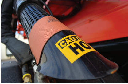
Vent-Flo™ Nozzle with Optional Heater