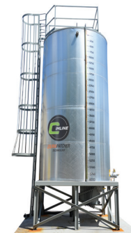
T-Series Stationary Tanks

Due to continuous improvement, specifications are subject to change without notice.