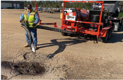
Ergonomic No-stress Boom