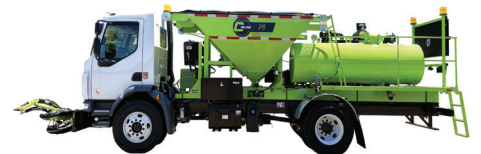
P5 One-Person Patcher with DuraPatcher™ Technology