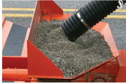
Gravity Feed Aggregate Delivery