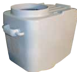
25 Gallon Hopper