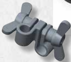
Dual Wing Nut Design for separate vertical and horizontal adjustments